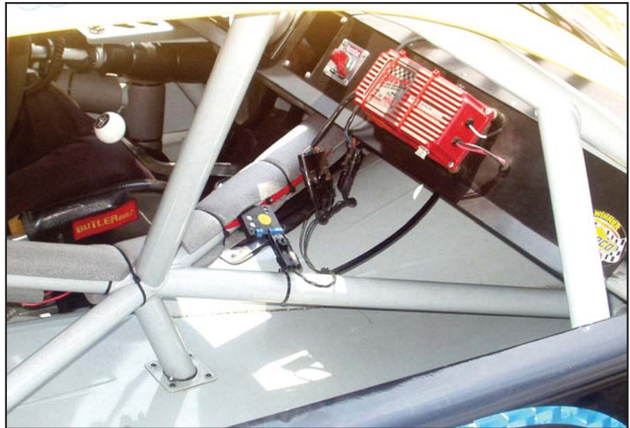
It only took a matter of minutes to install traction control in the cars of our volunteer test drivers. Of course, you would not normally run traction control in the open such as this, but its size allows it to be hidden by those who do use the device on a regular basis.

"It's not stomp-and-steer," Myers said when he returned to the pits. "I drove through it. I guess I tried too hard to make it work, because it would catch it, but it would catch it later. I was actually accelerating the problem; I wouldn't normally drive like that. We need to go five laps and then take it