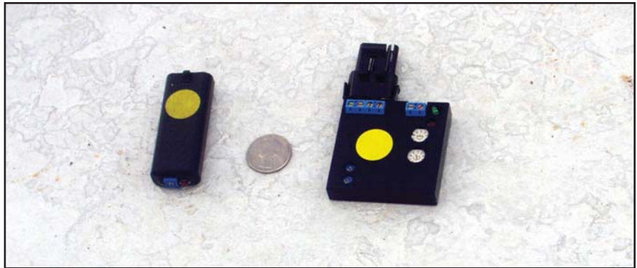
Traction-control devices are small. This is, of course, out of necessity, as in most racing series the penalty for getting caught with one can be huge.

"(If everybody had it) it would be the same opportunity for everybody. I mean, you give certain people opportunities and they can still screw it up. We've had several opportunities this year and we screwed them up. It can be used for your benefit, but if you don't use it right ... you've got springs, you've got shocks, you've got air pressure and you've got tires, and when we get down to the nitty-gritty of this deal it's about those four things that hit the racetrack. A place like Jennerstown