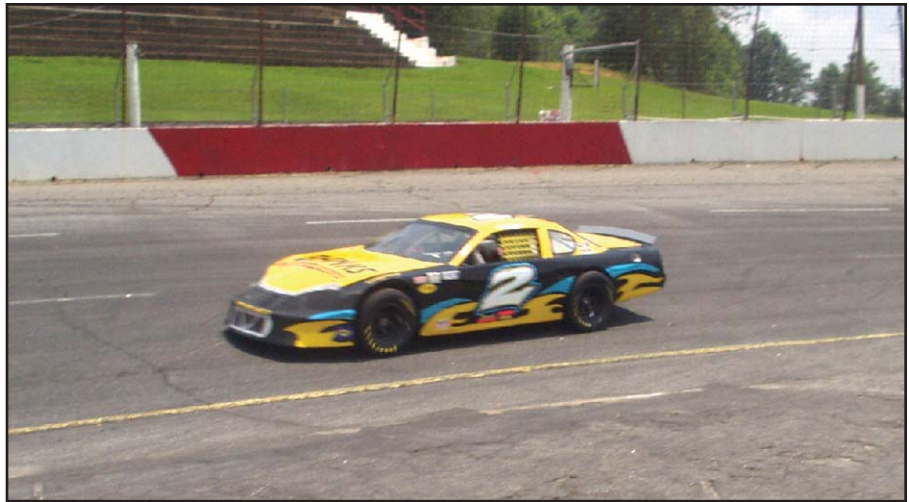
Art Elm photo

"In the middle of the chute it was actually hesitating a little bit," Rumley said. "That wasn't good. It was hesitating, like in the motor - but that might relate to wheel spin, too. This thing isn't going to make you fast off the get-go, but a 50-lap green-flag run? That's when the mechanical part overtakes our brain, 'cause our brain doesn't always work with our foot. It's 90 degrees, hotter than hell, and you're racing three other people ... that might help you. It'll definitely help you more on a long run than a short run. I wouldn't even want to hook it up for qualifying; I'd rather get the spin, I think you'd be quicker for two laps."